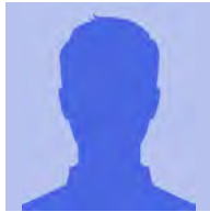
Tim Cook SPONSORED BY